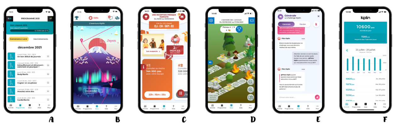
Figure 2 Screenshots of the Kiplin app. (A) The telecoaching sessions reservation. (B) The adventure. (C) The investigation. (D) The boardgame. (E) The chat. (F) The activity monitoring tool.

confronted with stigmatisation. Thus, the shared identities forged during a group-based intervention regrouping individuals with the same stigma (eg, weight status) could be the keystone for the emergence of a social identity and social support able to counteract the negative effects of group-based discrimination.